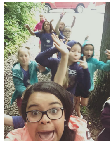
No counselors were harmed taking this photo

able to offer the camp experience to hundreds of young people each year without their act of service. It's not too early to start thinking about joining us for a bit this summer. No matter your particular skill set, if you can find the time, we can find a place for you! This year we are in particular need of male summer staff , camp nurses , and male and female volunteer counselors . Job descriptions and application forms are available at http://gocampchallenge.com/jobs/